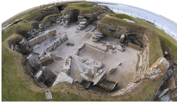
Skara Brae – an archaeological site that has remains from a village in the Neolithic Period.